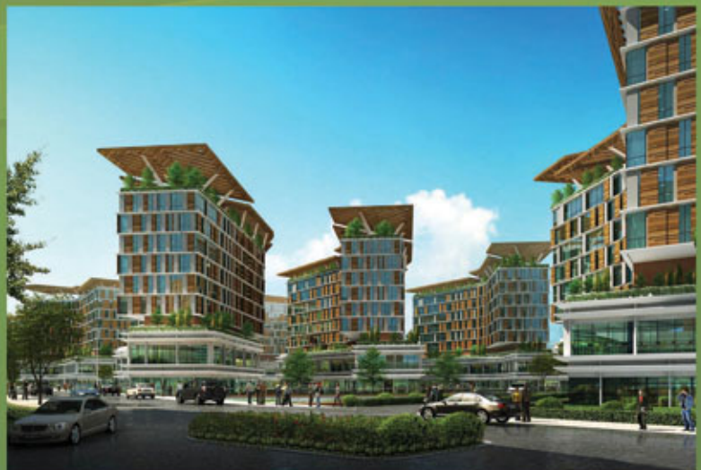
Sustainable architecture project in Zhihui Valley - Suzhou Science and Technology Town, China

We will do this in a way that makes commercial sense to our business by empowering people to change the way we consume energy, turning things off when they're no longer needed and investing in energy efficient technologies..