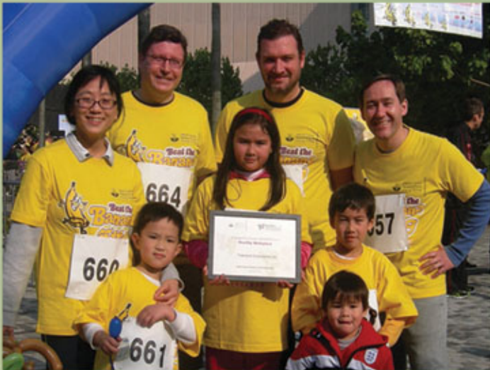
TOWNLAND team in the charity run "Beat the Banana"