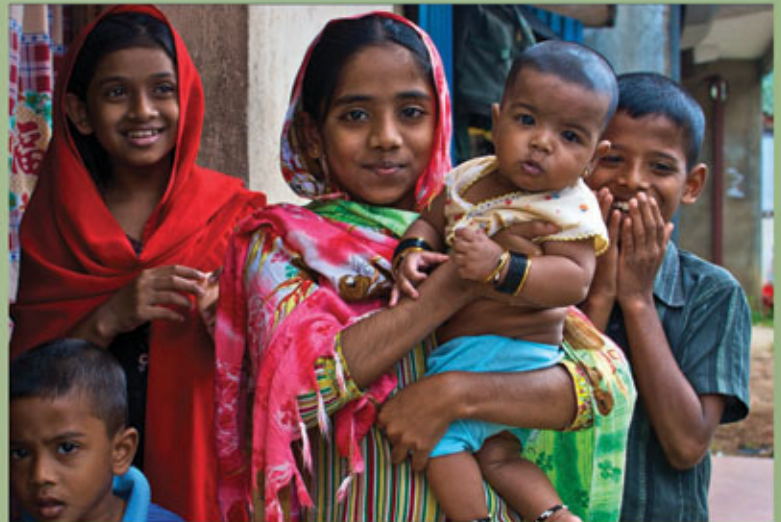
Social development project in India

TOWNLAND has set itself a target to reduce emissions of CO 2 by 5% by April 2012, relative to 2010/11.