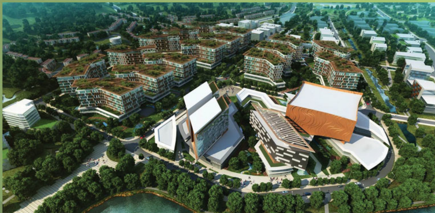
Sustainable Planning Project in Zhihui Valley, Suzhou Science and Technology Town, China

TOWNLAND provides a range of innovative approaches to sustainable planning, which guides all phases of the project development. We have been a strong advocate for many years of the benefits of New Urbanism, Smart Planning and Transit Oriented Development. These sustainable planning principles reap multi-fold benefits for developers, government and residents alike. TOWNLAND assists Clients in achieving the appropriate LEED Certification based on the Client's sustainability ambitions.